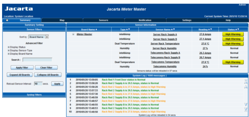
iMeter web-browser Interface - Comprehensive View

Each iMeter Slave provides 8 x sensor inputs/outputs and is equipped with daisy chain in and out ports for connection to the iMeter Master and/or further iMeter Slave devices using standard cat5 cable up-to 300m in length.