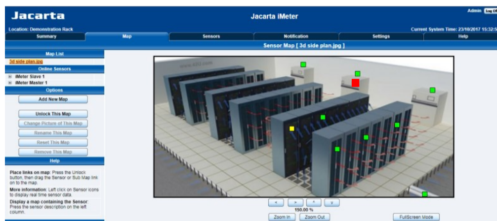
iMeter web-browser Interface - Map View